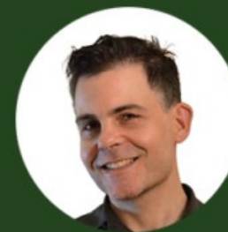
Dr. David Hanson Founder & CEO Hanson Robotics