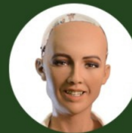
Sophia the Robot Hanson Robotics